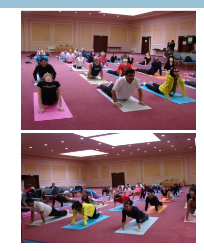
Indian travel companies attend Kazakhstan International Tourism